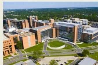
About UAMS More>>

Don't have an account? No worries. Create one now. You only need to create an account once.