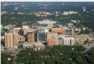
UAMS Home Website More>>