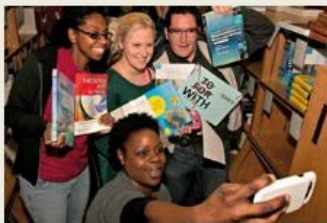
Student Life at UAMS More>>